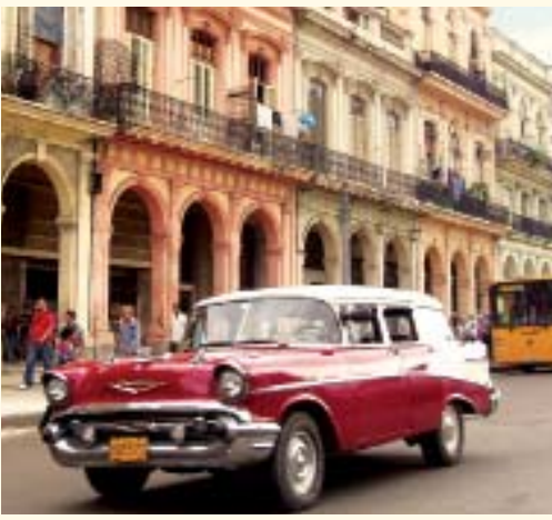
The streets of Cuba are a treasure trove of classic cars due to laws once prohibiting the sale of newer models.

PRSRRT STD U.S. Postage PAID Gohagan & Company