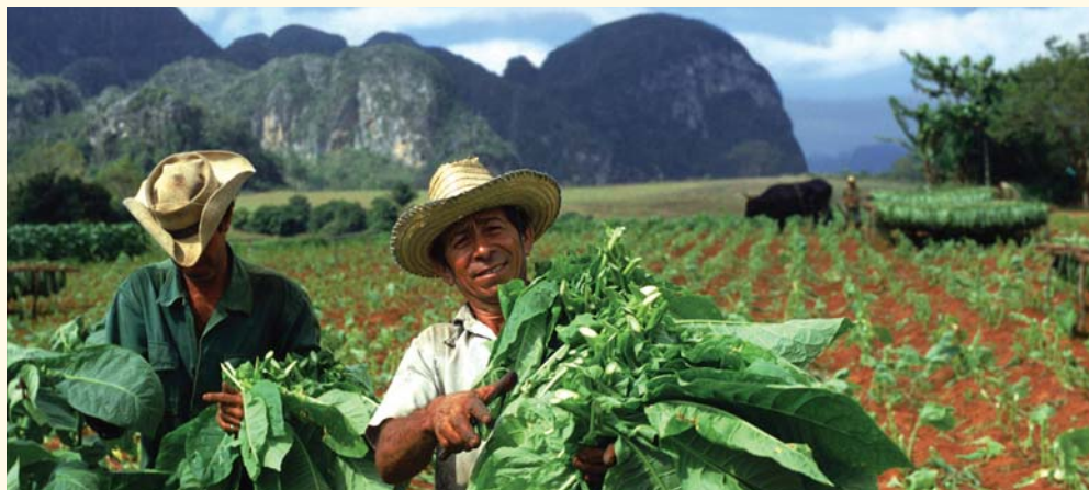
The agricultural province of Pinar del Río is home to the fertile Viñales Valley, a UNESCO World Heritage site where farmers grow some of the world's most premium cigar tobacco.