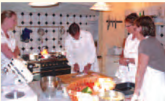
Discover firsthand the delights of preparing Tuscan cuisine, famous for its delectable flavors and rustic simplicity.