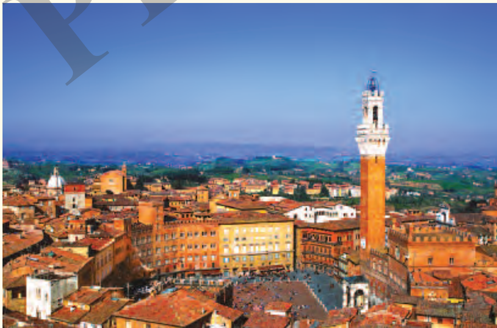
The well preserved, red tiled Torre del Mangia in Siena is the second tallest medieval bell tower in all of Italy. Insets above: Florentine Coat of Arms “Fleur-de-lis” (left) and Siena Coat of Arms “Provincia di Siena” (right).