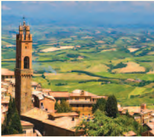
The ancient hill town of Montalcino provides sweeping views of Tuscany's fabled countryside.