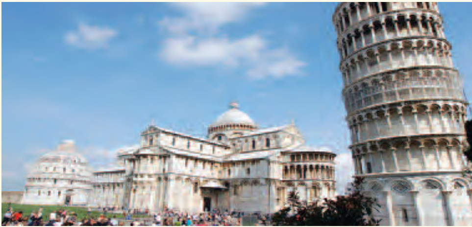
Pisa's Cathedral Square, a UNESCO World Heritage site, is dominated by four great religious edifices: the Leaning Tower of Pisa, the Duomo, the Baptistery of St. John and the Camposanto.