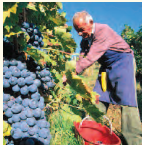
The beautiful Chianti region has produced its famous blends of sangiovese grapes since the 13 th century.

Despite its imposing 14 th -century Fortezza (fortress), classic flower-covered stone houses and steep and winding alleys, the idyllic Montalcino is perhaps best known for Brunello di Montalcino, Tuscany's most revered wine. This delightful town reveals a pleasant mix of