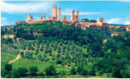
Bask in the classic Tuscan countryside of rolling hills dotted with olive groves, vineyards and red sandstone hill towns.