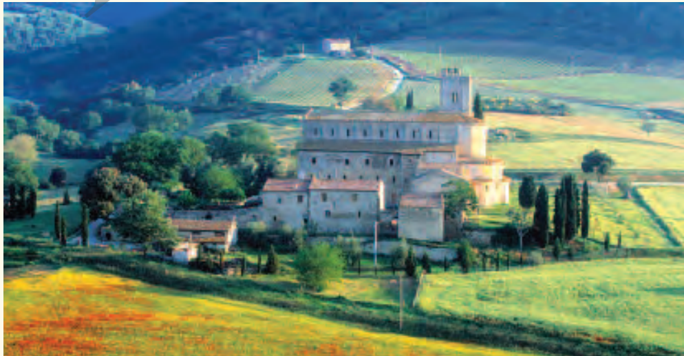
Observe firsthand one of the ancient traditions of the monks of Sant'Antimo as they sing Gregorian chants in this bucolic idyll.

The birthplace of the Renaissance, this iconic UNESCO World Heritage site is a treasure trove of the period's achievements in art, architecture and literature. Dante, Boccaccio and Giotto established the intellectual ascendancy of Florence in the first half of the 14 th century and that intellectual and artistic verve has resounded through the city ever since. Until the mid-1700s, Florence was one of Europe's most prosperous, powerful and progressive cities, as well as a mecca for Italy's greatest artists, sculptors and architects who left an unparalleled artistic heritage. The Galleria dell'Accademia, originally an art school founded in 1563, houses Michelangelo's David . This magnificent sculpture was carved from marble from the Carrara Mountains when Michelangelo was twenty-six years old and is considered to be his crowning achievement. The Uffizi Gallery includes a collection of masterpieces in one of the oldest and most famous museums in the Western World.