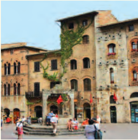
San Gimignano's charming Piazza della Cisterna is easily identified by its 800-year-old stone well.